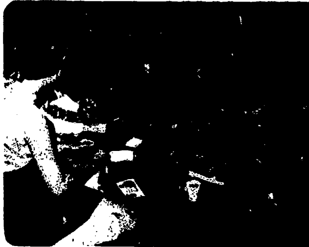
POSS Econ Simulation