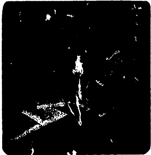
HASPEG Curriculum Workshop

Another source of evaluation was sought in 1973 when the administration appointed an evaluation team to conduct a general review of the POSS/HASPEG program; the team was composed of lay persons and teachers from other Danesville schools. The team's overall evaluation was quite positive; however, the evaluation team was concerned about the eighth graders' achievement scores and suggested more American history and political science be added to the program. Acting on their recommendation, the staff has added new units in these areas.